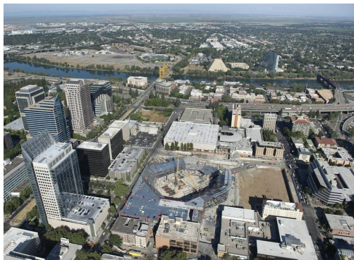
The downtown arena under construction on Friday, June 12, 2015 in Sacramento, Calif.

Sacramento's Downtown Plaza shopping mall was in decline and had become "a cancer in the center of our city" by the time the city and Sacramento Kings owners agreed to a deal to build a new arena at the site, a top city official said Monday in court.